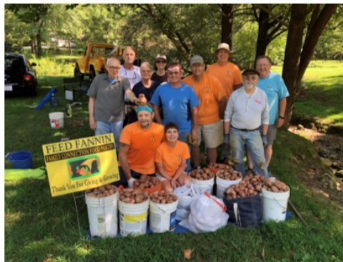
Our Forge Mill partners' red potato harvest

We lost good soil in areas of the Ada Street Garden during the construction of a water line. Rich soil had to be added at Ada Street as well as the Forge Mill Garden to improve the nutrients. Adding soil and soil amendments to both gardens has helped