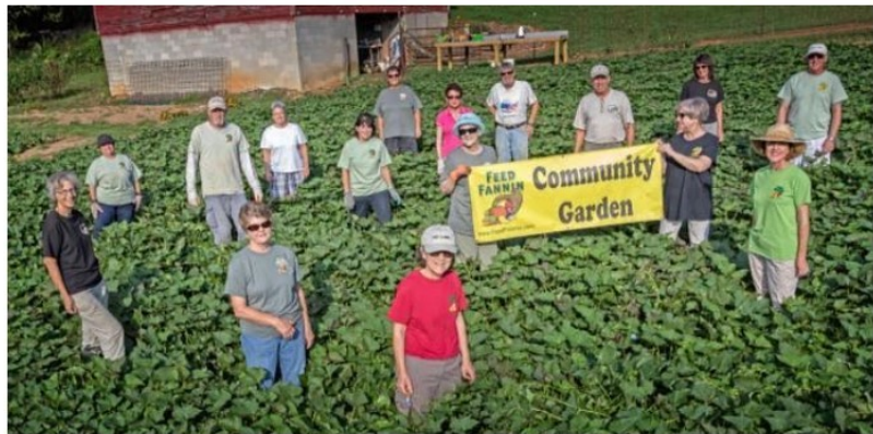
Feed Fannin volunteers standing in the sweet potato patch at the Ada Street Community Garden

"The growth continues beyond the 16,000 of our fellow citizens who are clients of the food pantry. We have an aggressive education program. We are building a new website to bring our message to the community and create an ongoing dialogue in Fannin County on issues that affect low-income