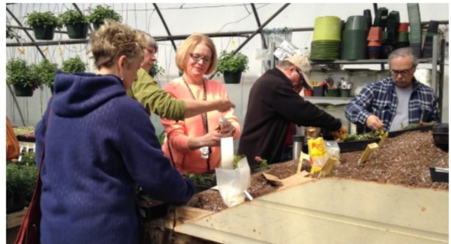
Aspiring gardeners learning to start seeds at a Feed Fannin class

Classes will be advertised in the local papers and posted on the Feed Fannin website at FeedFannin.com . Come and learn with us! 🌱