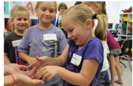
BRES Students learning about gardening

Through our support services, we also help the schools and other organizations build new educational gardens and sustain existing gardens with supplies, training and consultation. We provide seeds, starts, soil, gardening tools and supplies, garden education and design consultation. 🌱