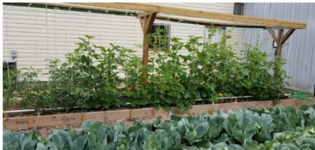
The Mittleider research garden at Fannin County Family Connection