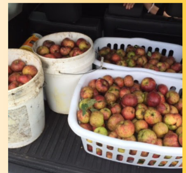
Organic apples donated