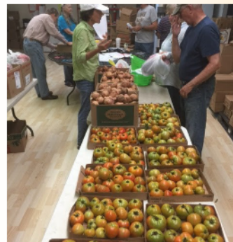
Volunteers clean and sort all produce before it is placed in the boxes.