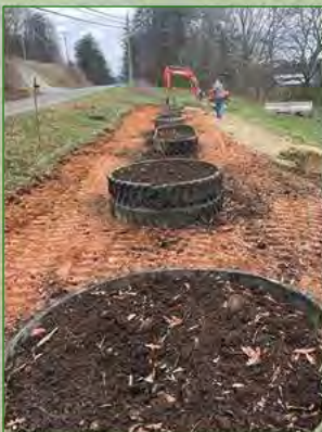
Raised beds made using donated skid tracks.