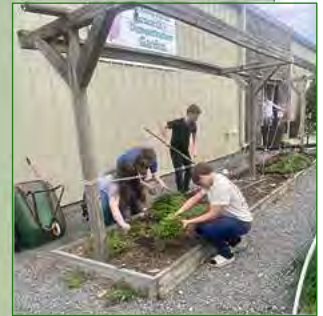
Students from Fannin County Middle School help move plants from the old research garden on Community Service Day.