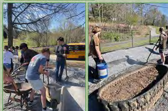
FFA students from Fannin High School spread gravel on top of the weed barrier fabric.