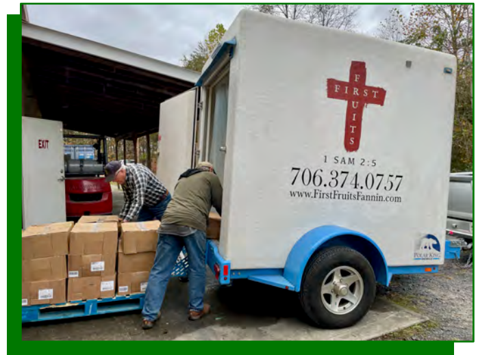
The First Fruits truck is loaded with hams, turkeys and staple goods to provide hot holiday meals to those in need through its mobile kitchen.

Total poundage for the 2025 Holiday Meals