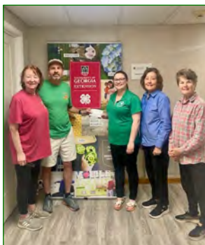
Board members present a check providing tuition for 14 students to attend 4-H camp this summer. An anonymous donor has contributed $4,000 to this initiative!

experiences, aligning with Georgia 4-H's mission to equip youth with knowledge, life skills and positive attitudes for future success. This hands-on approach resonates with Feed Fannin's mission of promoting education and self-sufficiency.